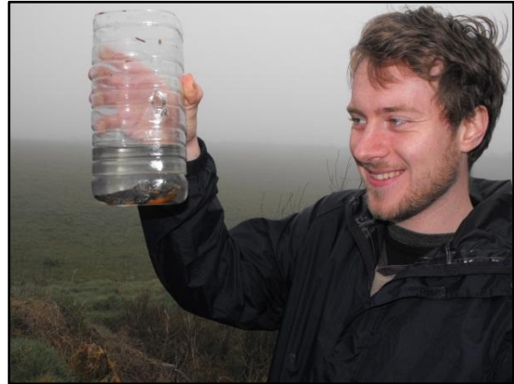
2 nd yr FdSc Applied Ecology student capturing an Alpine newt in Cornwall.

surveys identifying where action can be effective, while also providing opportunities for awareness raising, research and engagement with partners. For example, the newt work involves close collaboration with local residents and landowners, the University of Kent, the Institute of Zoology and the Cornwall Reptile & Amphibian Group.